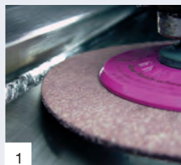
1 POLY-MAGIC-WHEEL A (80 grit)